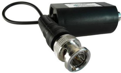
Ground Loop Isolator BNC Male with 100mm Mini Coax to BNC Female Part Number: E10500 (Camera End)