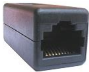
Rear View of E10190R

The video balun will enable video signal to be interfaced using coaxial on one side to Cat 5 twisted pair cabling on the other using modular RJ45 connectors to achieve quick and reliable connections.