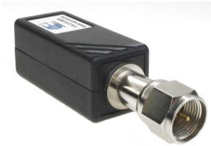
Video Balun F Male to RJ45 Slim Part Number: E10190R