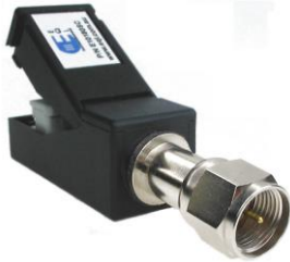
Quick Connect Video Balun F Male to IDC Part Number: E10190C