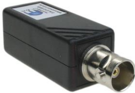
Video Balun BNC Female to RJ45 Slim Part Number: E10185R