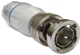
Tubular Easy Connect Video Balun BNC Male to Push Terminal Part Number: E10180V