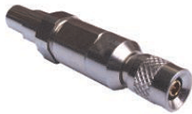
1.0/2.3 Male Part No: E10260xx